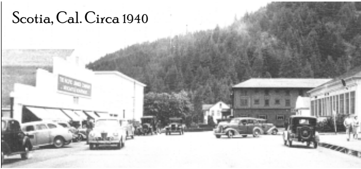
Scotia, Cal. Circa 1940